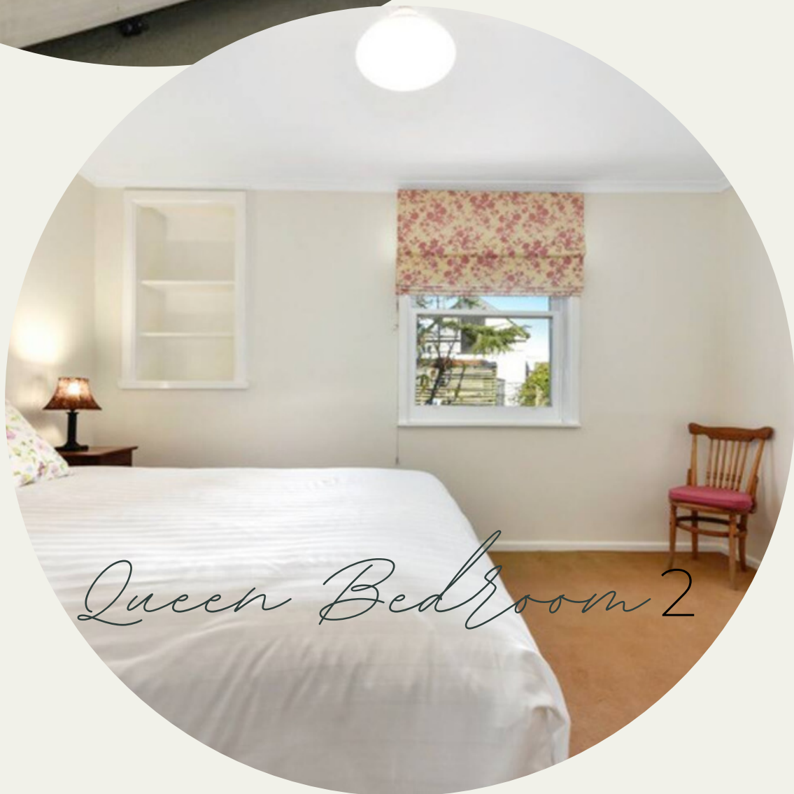
Queen Bedroom 2