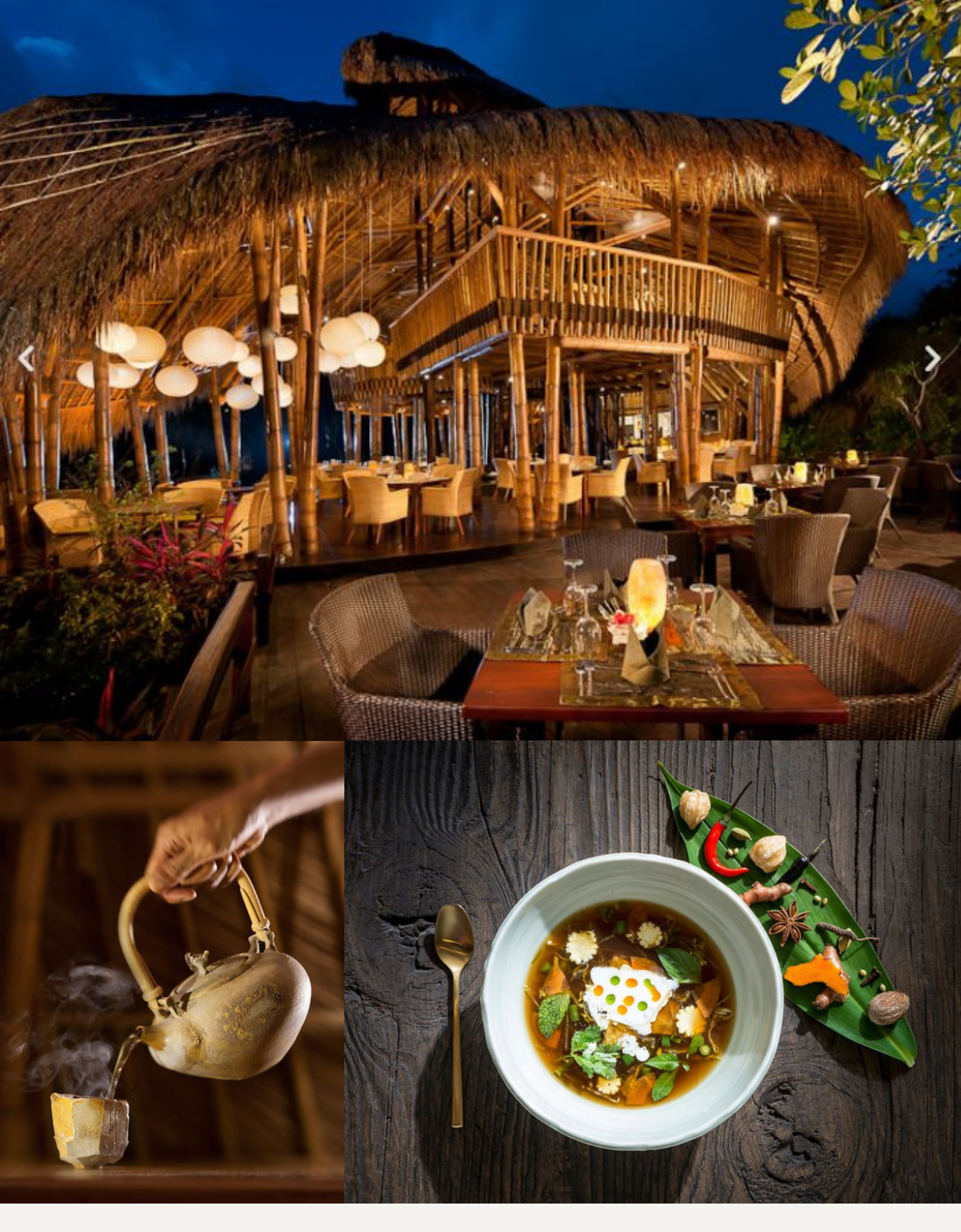
BREAKFAST, LUNCH & DINNER IN THE AWARD WINNING SAKTI DINING ROOM