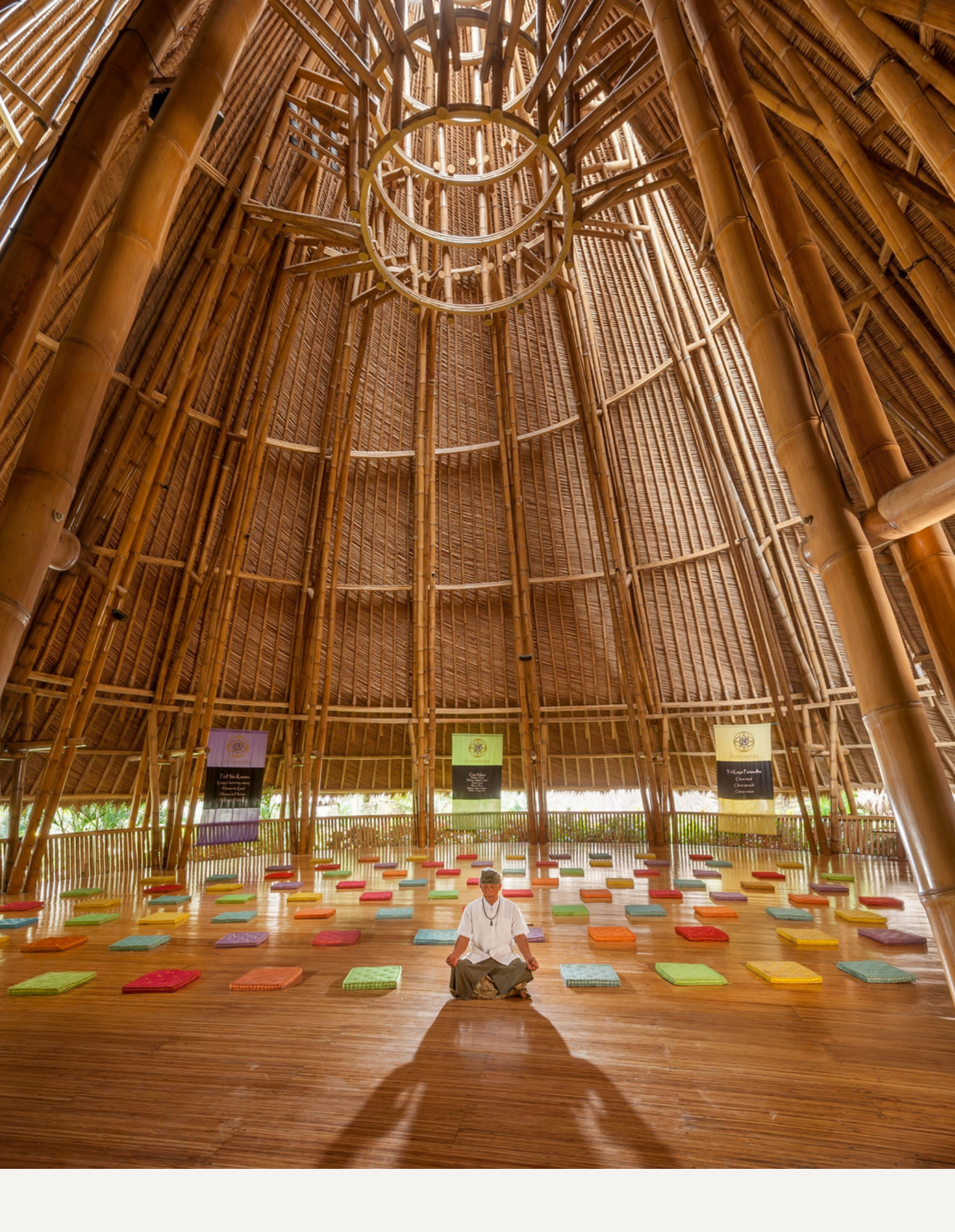
DAILY YOGA WITH TINA