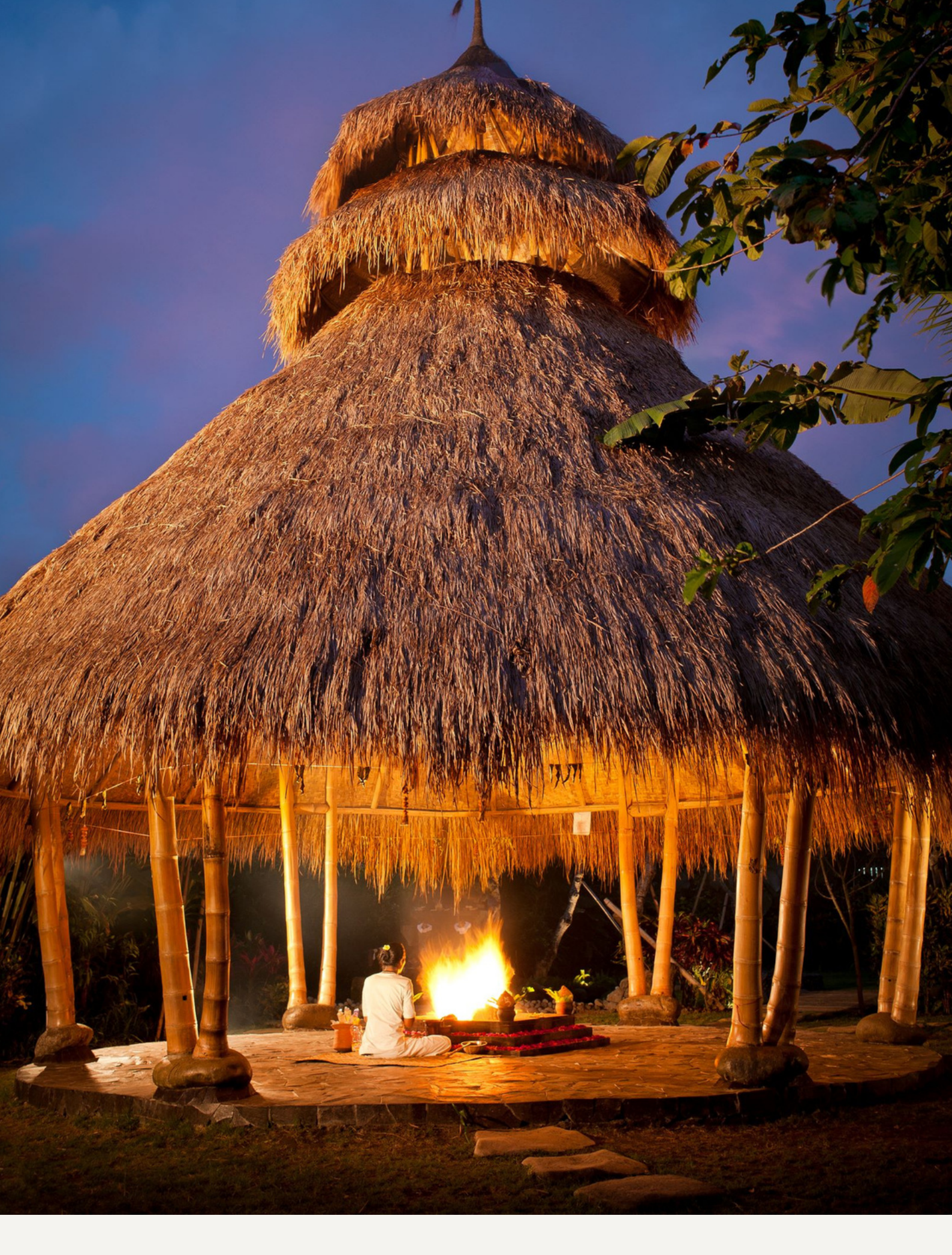
90MIN AGNI HOTRA FIRE CEREMONY